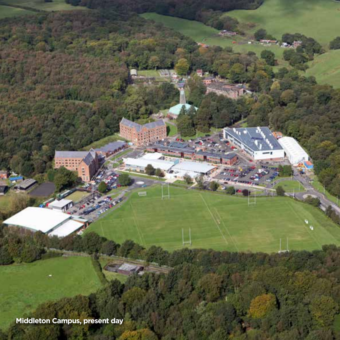
Middleton Campus, present day