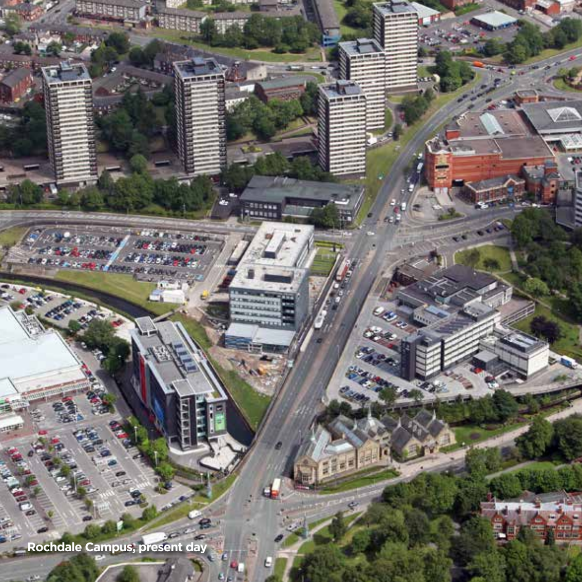
Rochdale Campus, present day