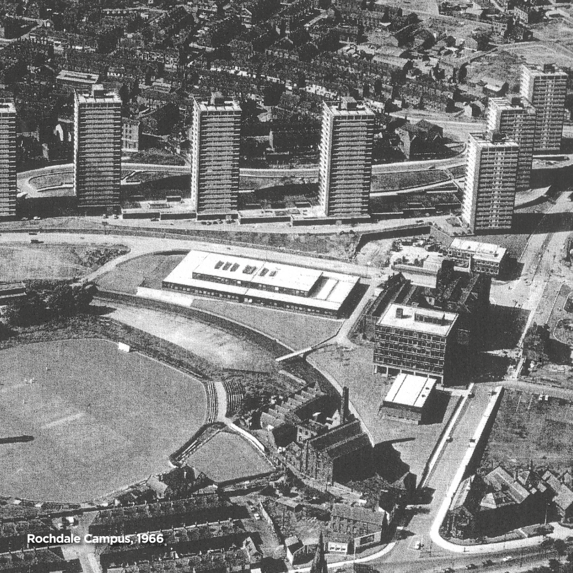
Rochdale Campus, 1966