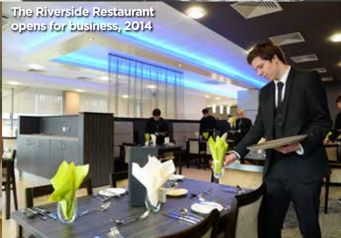
The Riverside Restaurant opens for business, 2014