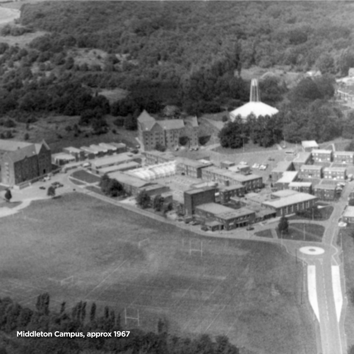
Middleton Campus, approx 1967