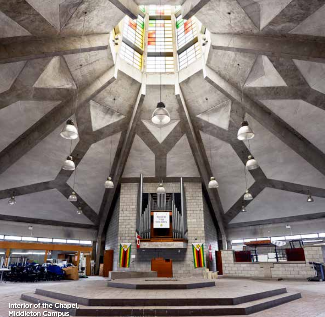
Interior of the Chapel, Middleton Campus